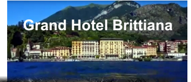
Grand Hotel Britannia

September 30 - We will be transported to the airport for our flight home.