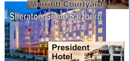
Sheraton Grand Salzburg