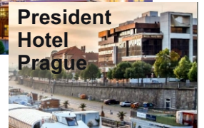
President Hotel Prague

This trip is limited to 32 Full Package Cost: $TBD