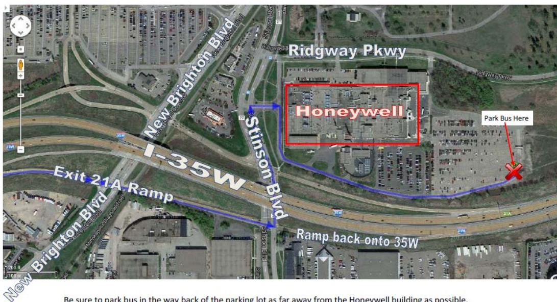
Be sure to park bus in the way back of the parking lot as far away from the Honeywell building as possible.

Bus will load by 7am and leave at 730am sharp! Meet the bus at Honeywell 2600 Ridgway Parkway, Minneapolis, MN 55413. Park in the lot on the south side of the building, next to 35W and farthest to the east (see map below). Honeywell says “Just make sure you have all you people park together, in spaces near the back of the lot. Do not block aisles or the snow removal equipment. The snow people also need access to the entire back (EAST) border of the lot, to move snow to when they plow”.